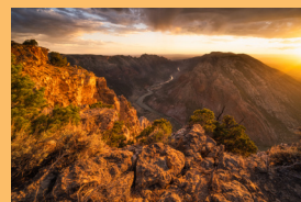
Louis Kamler - After the Goldrush